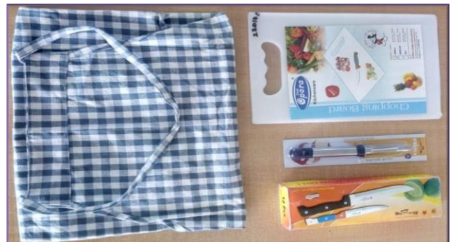
Kit for Catering Candidates